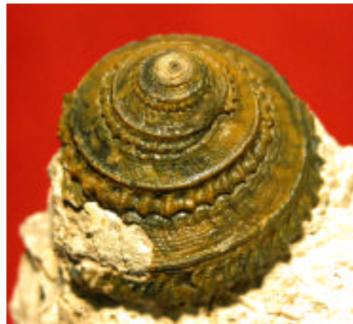
Pleurotomaria cf. yeovilensis , \phi 35mm, apex not preserved