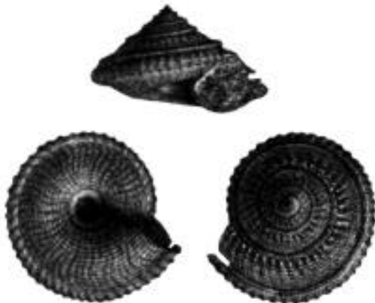
Purpurina sp., \phi 20mm

Summary: The initial collection is disappointing but this is an on-going study with the major objective of a complete section, especially of the ammonite fauna. Therefore, we hope another, thicker, section of less weathered Green Marl can be examined in future.