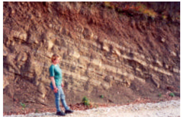
Fig. 4. Sinivir Formation (Rhaetian-Lower Jurassic), Cheshme Bair, Balaban Dere valley, Varna District (eastern Bulgaria).

To resolve these problems, which are interesting for the Triassic-Jurassic geology of Bulgaria, a team of Triassic and Jurassic stratigraphers and palaeontologists, tectonicians and sedimentologists obtained a grant for a project on the “Stratigraphy of the turbidite sediments – Upper Triassic-Lower Jurassic in Eastern Stara Planina Mountains” from the Bulgarian National Science Foundation for the years 2003-2006. Work on this project is in the beginning.