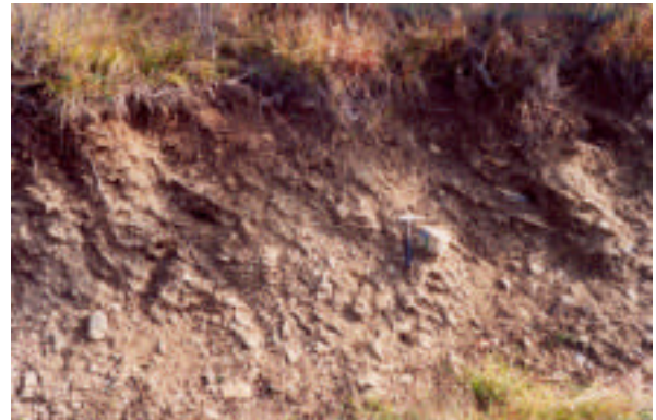
Fig. 3. Glogova Formation (Carnian- (p.p.), Cheshme Bair, Balaban Dere valley, Varna District (eastern Bulgaria).

calciturbidites (Fig. 3 – Glogova Fm in Chechne Bair) underlie uppermost Upper Triassic-Lower Jurassic siliciclastic turbidites (Fig. 4 – with Lucy) (Budurov et al., in press). The problem concerns the character of this contact in deep water turbidite sediments and the position of the Triassic/Jurassic boundary. It relates also to the problem of the tectonic situation of the Triassic-Jurassic sediments in eastern Stara Planina Mts. and their connections to west and east (Tchoumatchenco, 2003, fig. 1). Is there a direct connection westwards with the Romanian Cămin-Severin Terrane?