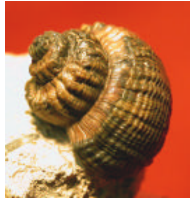
Pl. yeovilensis , Hudleston, Plate XXXIX fig. 8 a-c

Miscellaneous genera: Purpurina spp, Spinigera spp, Pseudomelania spp., Natica spp., Amberleya spp. Pleurotomariidae: P. elongata , P. actinophala , P. yeovilensis .