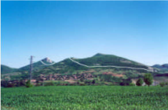
Fig. 1. General view of Orta, Ouch and Kodzha Kaya heights – Upper Triassic olistolite in the Middle Jurassic Kotel Formation, near the village of Bilka, Louda Kamchia valley, Burgas District (eastern Bulgaria).

still regarded them as olistolites. Kanchev (1993, 1995) published a map, accompanied by explanatory notes, in which he showed the sediments of the Sini Vir and Balaban Fms. (now proven to be Lower Jurassic) as Upper Triassic, in a tectonic position over the “Lower-Middle Jurassic“ rocks of the Kotel Fm. According to his opinion (Entcheva & Kanchev, 1967), the Sini Vir Fm of Tchoumatchenco & Cernjavaska (1989) and Tchoumatchenco et al (1992) are only Upper Triassic.